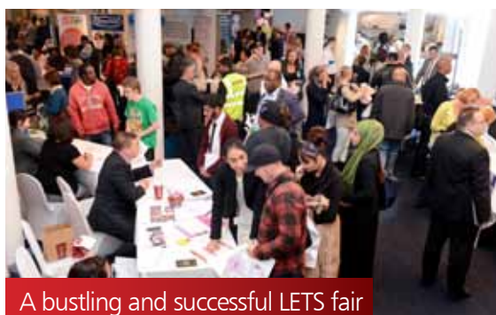
A bustling and successful LETS fair