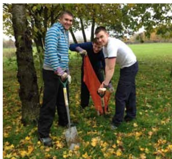
Thomsons staff proudly survey their hard work.

If you're a business and are interested in helping to improve one of Luton's green spaces, please email volunteering@luton.gov.uk