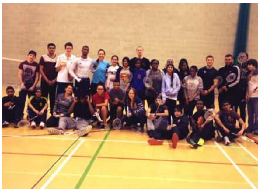
Get on track at Luton Sixth Form College

Whilst the current programme is taking place at Luton Sixth Form College, there will be another programme taking place later in the year at a community venue and anyone interested in taking part can contact the Community Development Service on 01582 54 87 75 .