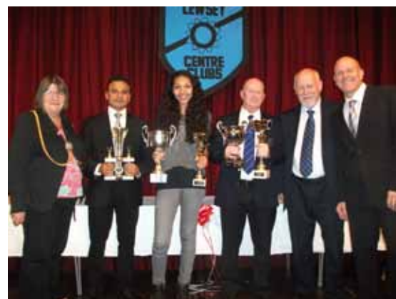
Awards winners celebrate with local VIPs