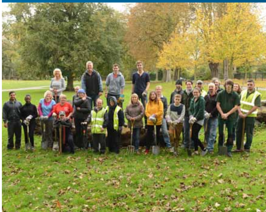
One of the many groups of fantastic volunteers that supported the day

For further details on volunteering opportunities and corporate challenge days, or to request an information pack, please call 01582 54 87 73 or email volunteering@luton.gov.uk