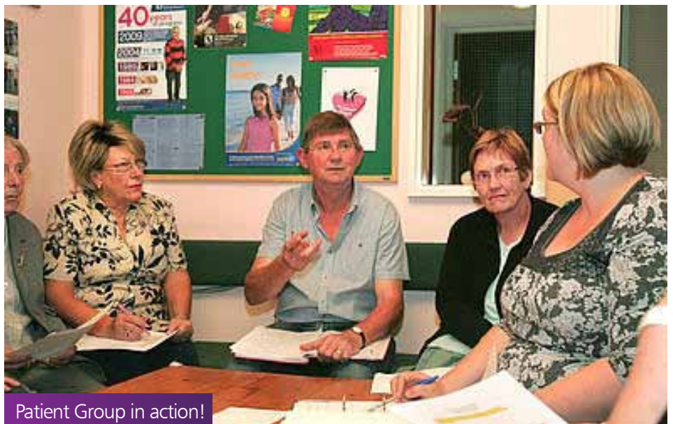
Patient Group in action!

We will keep you updated as we progress and welcome your feedback on where you see improvements and where there is room to improve. contactus@lutonccg.nhs.uk